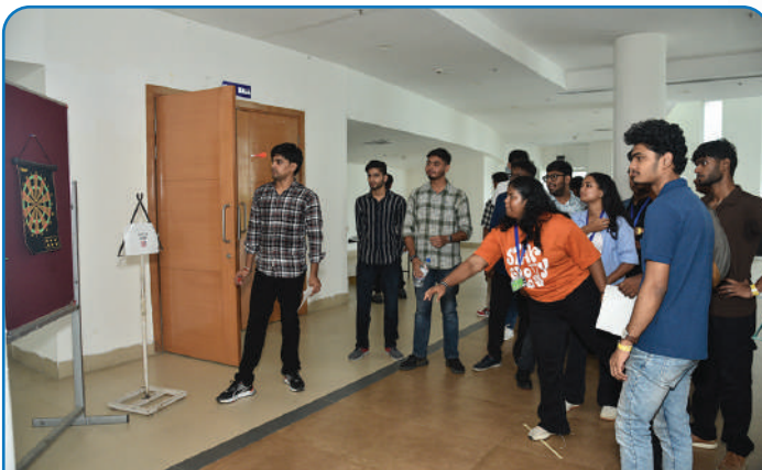
Interactive Games Designed to Improve Students Focus