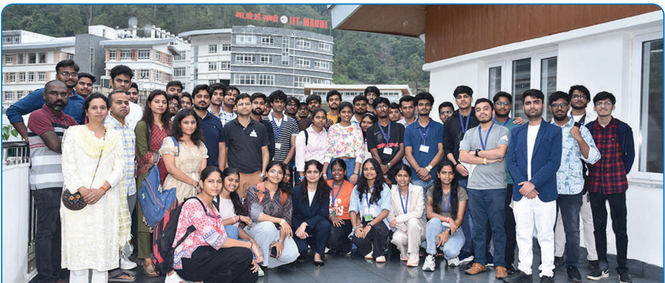
Group Photo at IIT Mandi