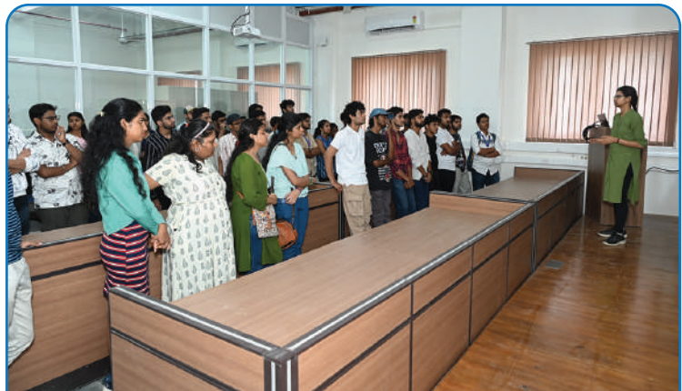
Immersive Learning : 5G Technology Lab Visit at IIT Mandi