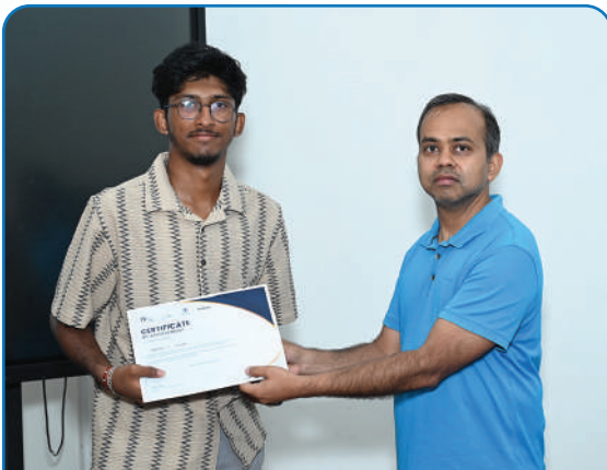
Certificate Distribution to Hackathon Winners