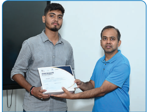
Certificate Distribution to Hackathon Winners