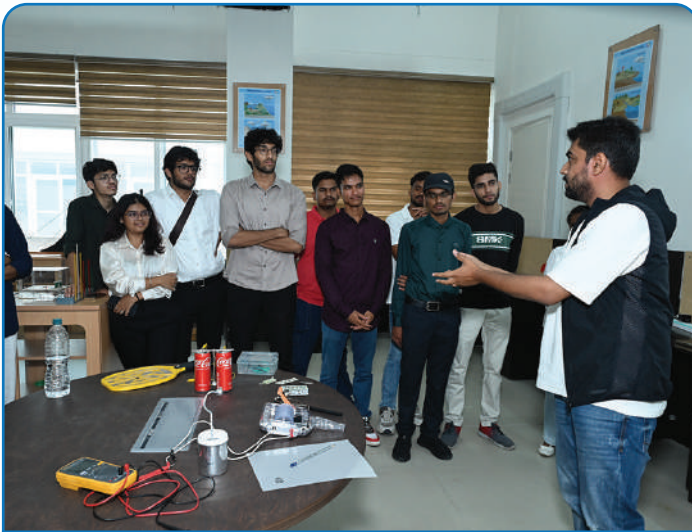
Innovation in Action : Tinkering Lab Interaction with PhD Scholars